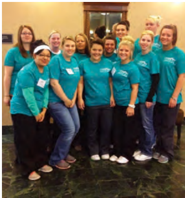
ANC Dental Assisting Club

The Student Dental Assisting Club is dedicated to promoting dental services to the underserved. This year the entire club participated in the Missouri State Dental Association Mission of Mercy. The Missouri Mission of Mercy (MOMOM) is a large-scale dental clinic that provides free oral healthcare to patients of all ages who cannot otherwise afford care. MOM events across America have been providing free dental services for the underserved since 2000. These clinics have helped more than 100,000 patients and provided nearly $50 million in free dental services since inception.