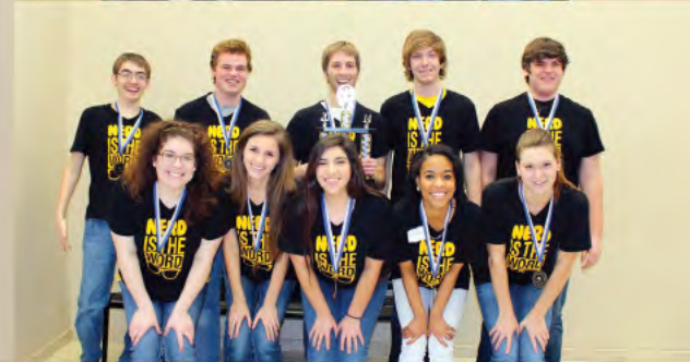
QUIZ BOWL WINNERS: (LEFT) CHAMPIONS - Greene County Tech; (TOP-RIGHT) 2ND PLACE - Caruthersville; (BOTTOM-RIGHT) 3RD PLACE - Kennett