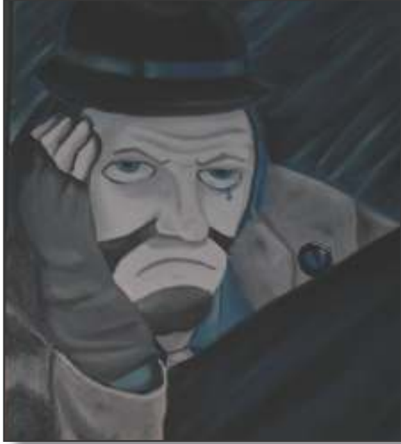
The Sad Clown