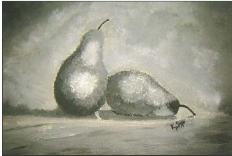
Pears By Kelsey Staggs