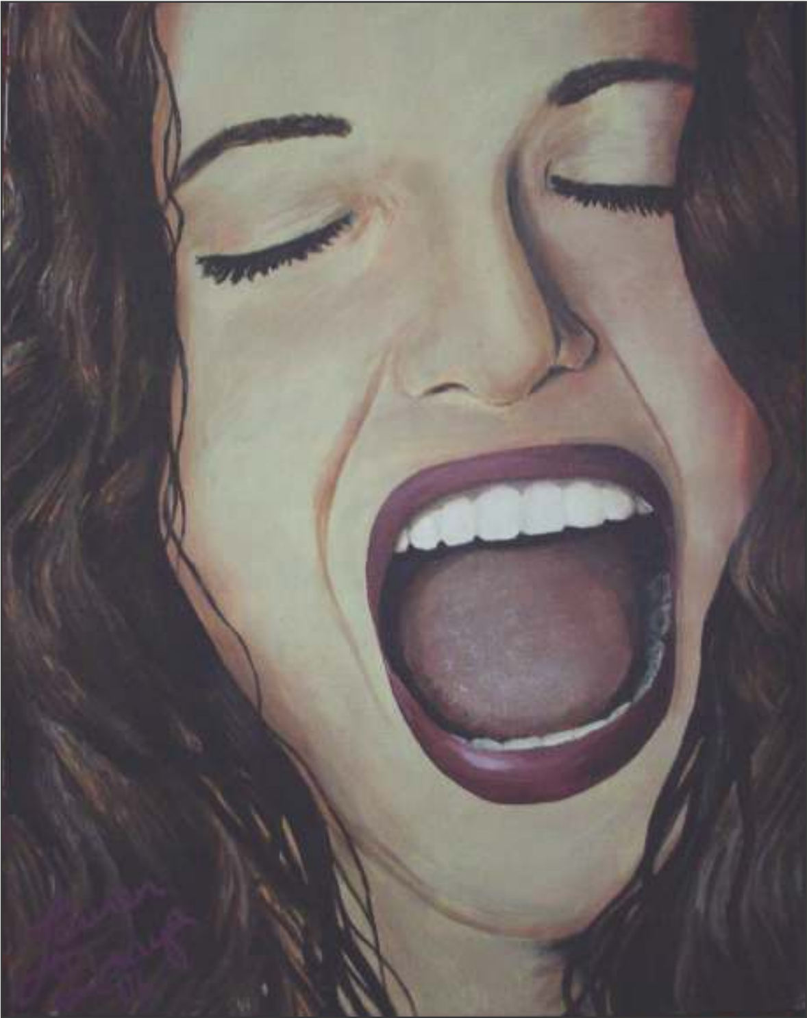
Stubbed Toe By Lauren Grays